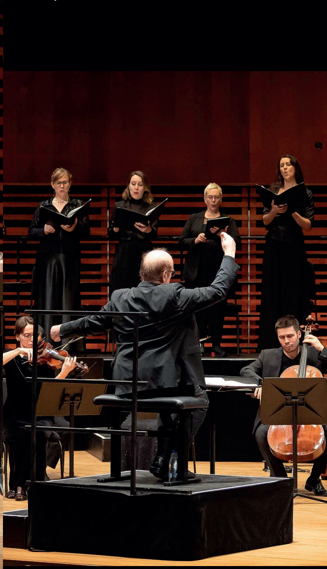
The concert Bach, que ma joie demeure with La Chapelle de Québec, conducted by Bernard Labadie on December 7, 2022, at Palais Montcalm.